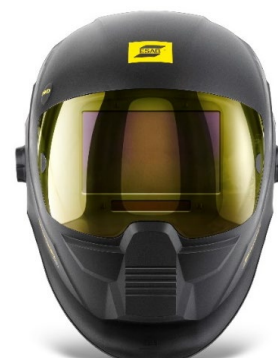
Compact shell with optional amber-colored protective outer lens.