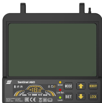
Advanced CE 1/1/1/1 ADF technology with a simple interface and clear graphic display.